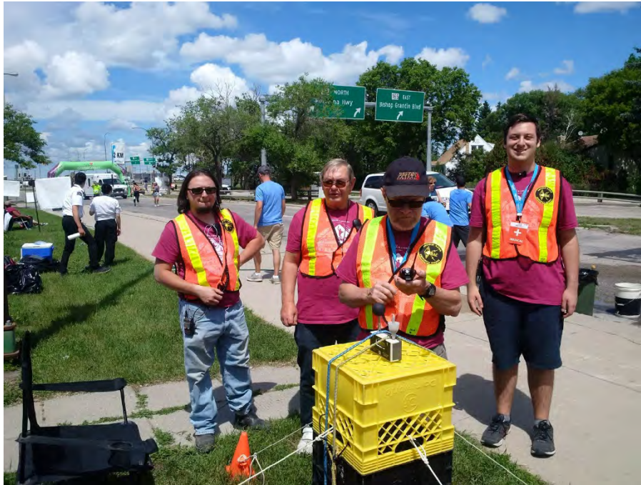
Mile 25 Hospitality Net and Wet Bulb Operators VA4CQD, VE4NQ, VE4STS, NJR