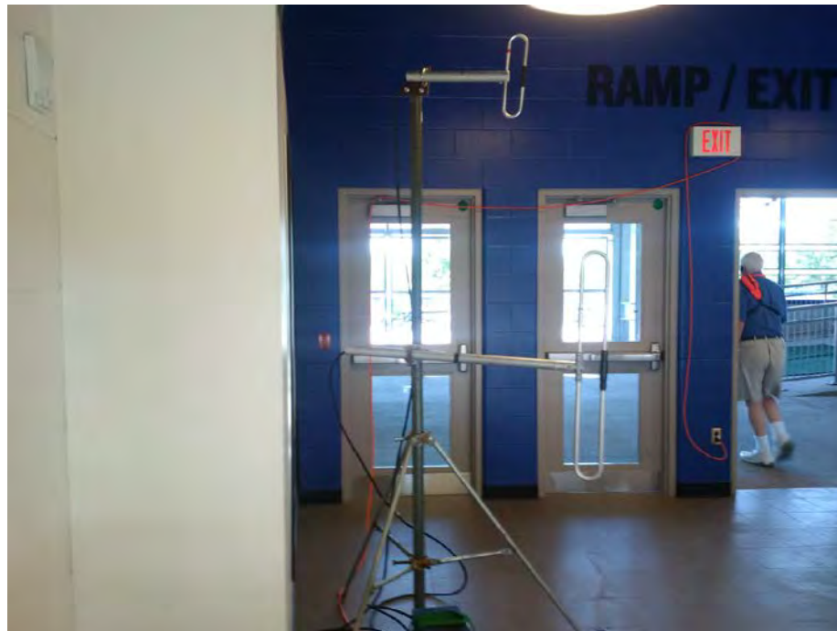
Cross-Band Repeater Antenna Location